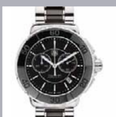
TAG Heuer Formula 1 Chronograph: $1,900 @ Ben Bridge