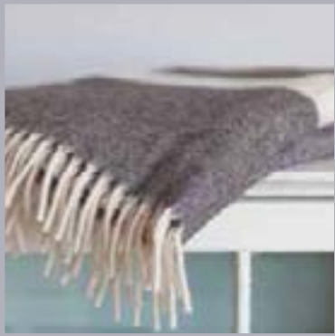
Wool Throw: $129.95 @ Faribault Woolen Mills