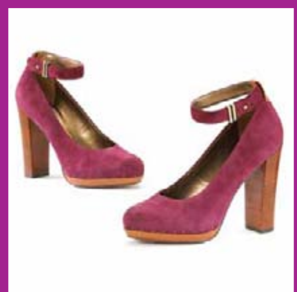
Sam Edelman Lyla Platform: $150 @ Bloomingdale's

Visit mallofamerica.com for holiday shopping hours