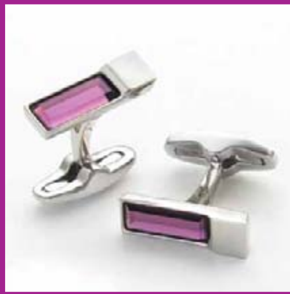
Amethyst Cufflinks: $70 @ Swarovski