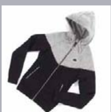
Knit Sweater: $150 @ Nike