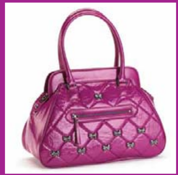
Tea Party Handbag: $248 @ Betsy Johnson