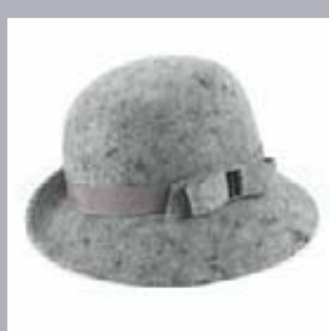
Cloche Hat: $36.99 @ Chapel Hats