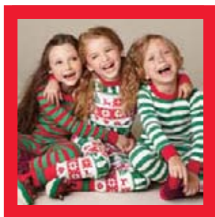
Organic Cotton Long Johns: $28 each @ Hanna Andersson