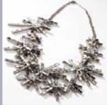
Palace Collection Necklace: $700 @ Swarovski