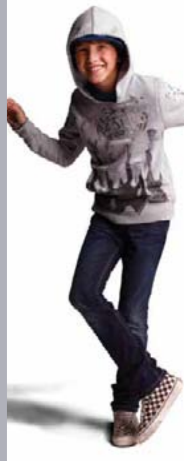
77kids by American Eagle, 214 South Avenue