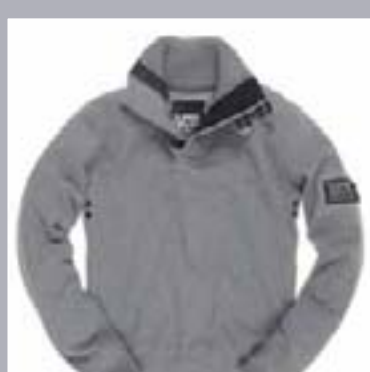
Seadog Henley: $200 @ Superdry