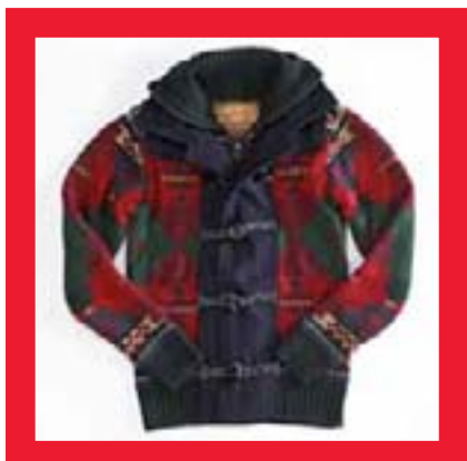
Toggle Sweater: $214 @ Designal