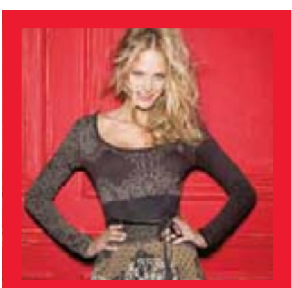
Designal, 144 South Avenue