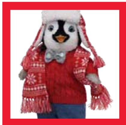
Eric the Penguin: $51.50 @ Build-A-Bear Workshop