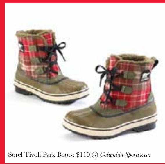
Sorel Tivoli Park Boots: $110 @ Columbia Sportswear