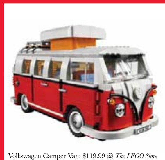
Volkswagen Camper Van: $119.99 @ The LEGO Store