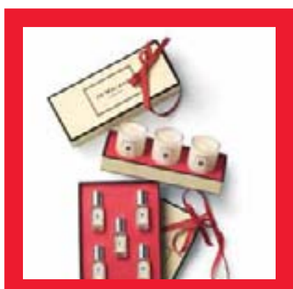
Jo Malone Gift Sets: $95 each @ Nordstrom