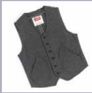
Herringbone Vest: $128 @ Levi's