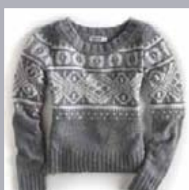
Fairisle Cable Sweater: $34.90 @ Garage