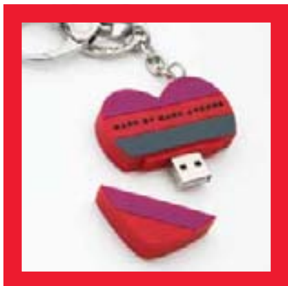
Marc by Marc Jacobs Flash Drive: $42 @ Bloomingdale's