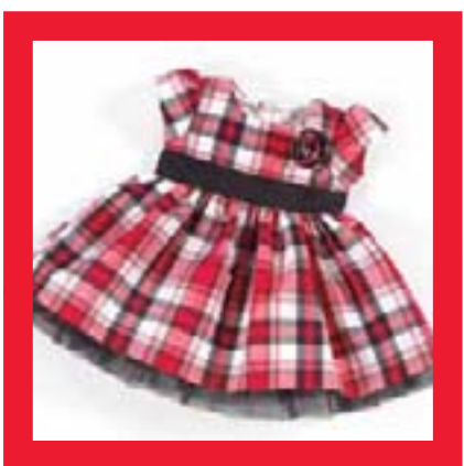
Plaid Dress: $20 @ Carter's