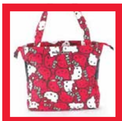
Hello Kitty Tote: $48 @ Sanrio