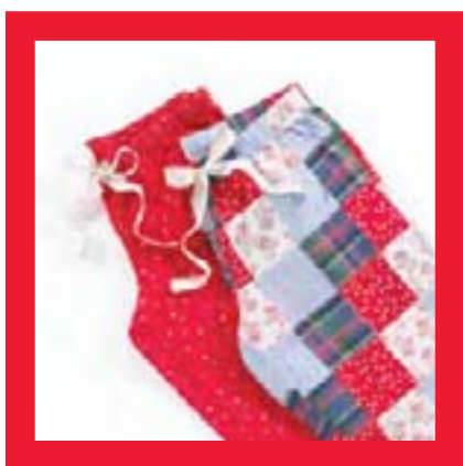
Pajama Pants: $29.50 each @ Aerie