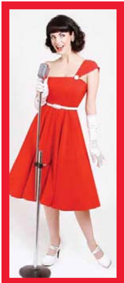
Surprised Dress: $122 @ Bettie Page Clothing