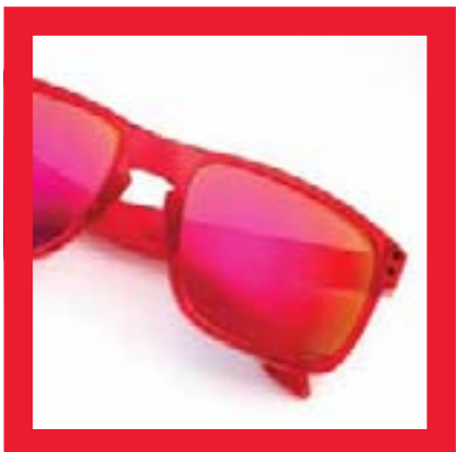
Holbrook Crystal Sunglasses: $120 @ Oakley