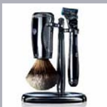
Power Shave Collection: $450 @ The Art of Shaving