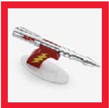
Acme Ray Gun Desk Pen: $140 @ Paradise Pen