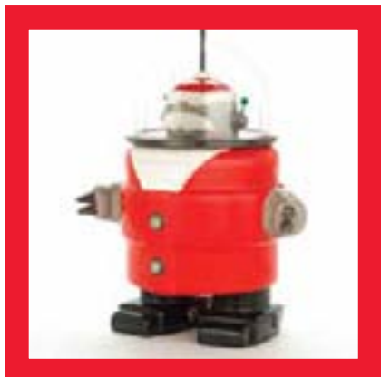
Santa Robot Cookie Jar: $85 @ The Afternoon