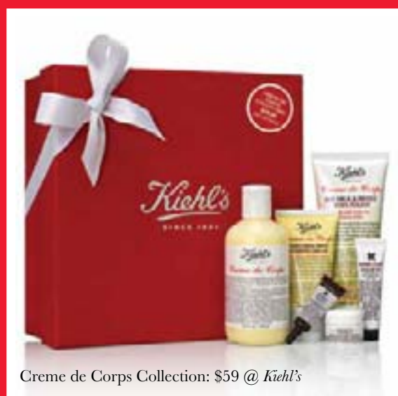
Creme de Corps Collection: $59 @ Kiehl's