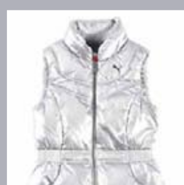
Women's Down Vest: $85 @ Puma