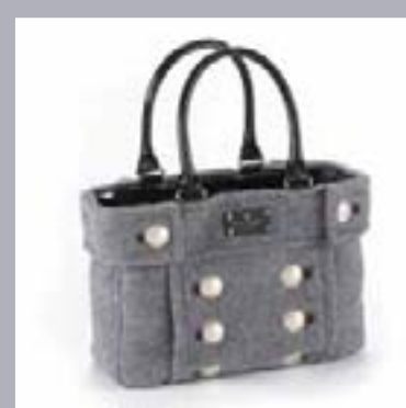
Kate Spade Handbag: $295 @ Bloomingdale's