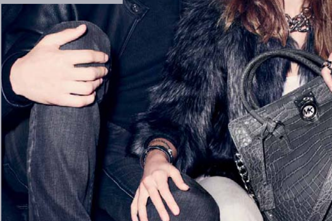
Michael Kors, 184 South Avenue