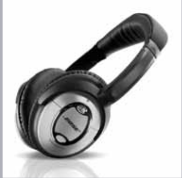
QuietComfort® 15 Acoustic Noise Cancelling® Headphones: $299.95 @ BOSE