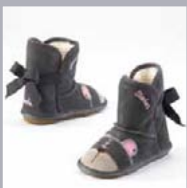
Kids' Boots: $42 @ Skechers