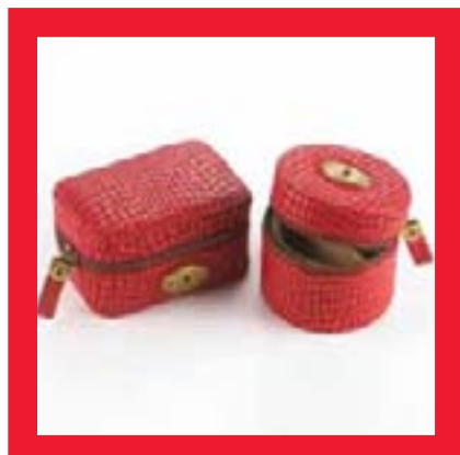
Jewelry Cases: $40 each @ Fossil