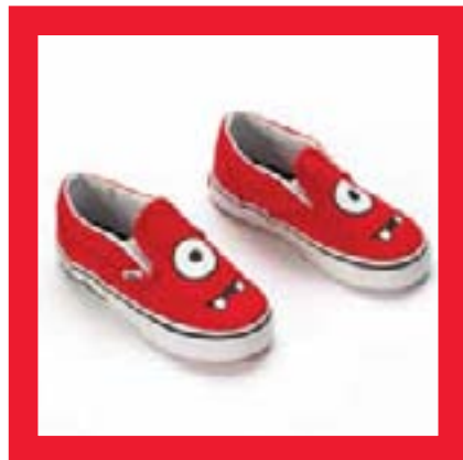
Yo Gabba Gabba! Slip-Ons: $32 @ Vans