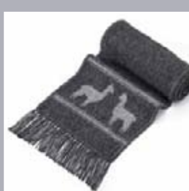
Alpaca Scarf: $20 @ Alpaca Connection