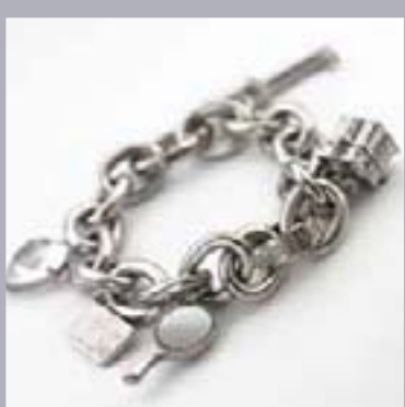
Charm Bracelet: $38 @ A|X Armani Exchange