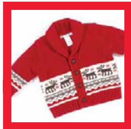
Reindeer Cardigan: $54 @ Jamie and Jack