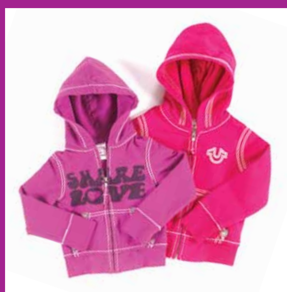
Kids' Zip-up Hoodies: $99 each @ True Religion Brand Jeans