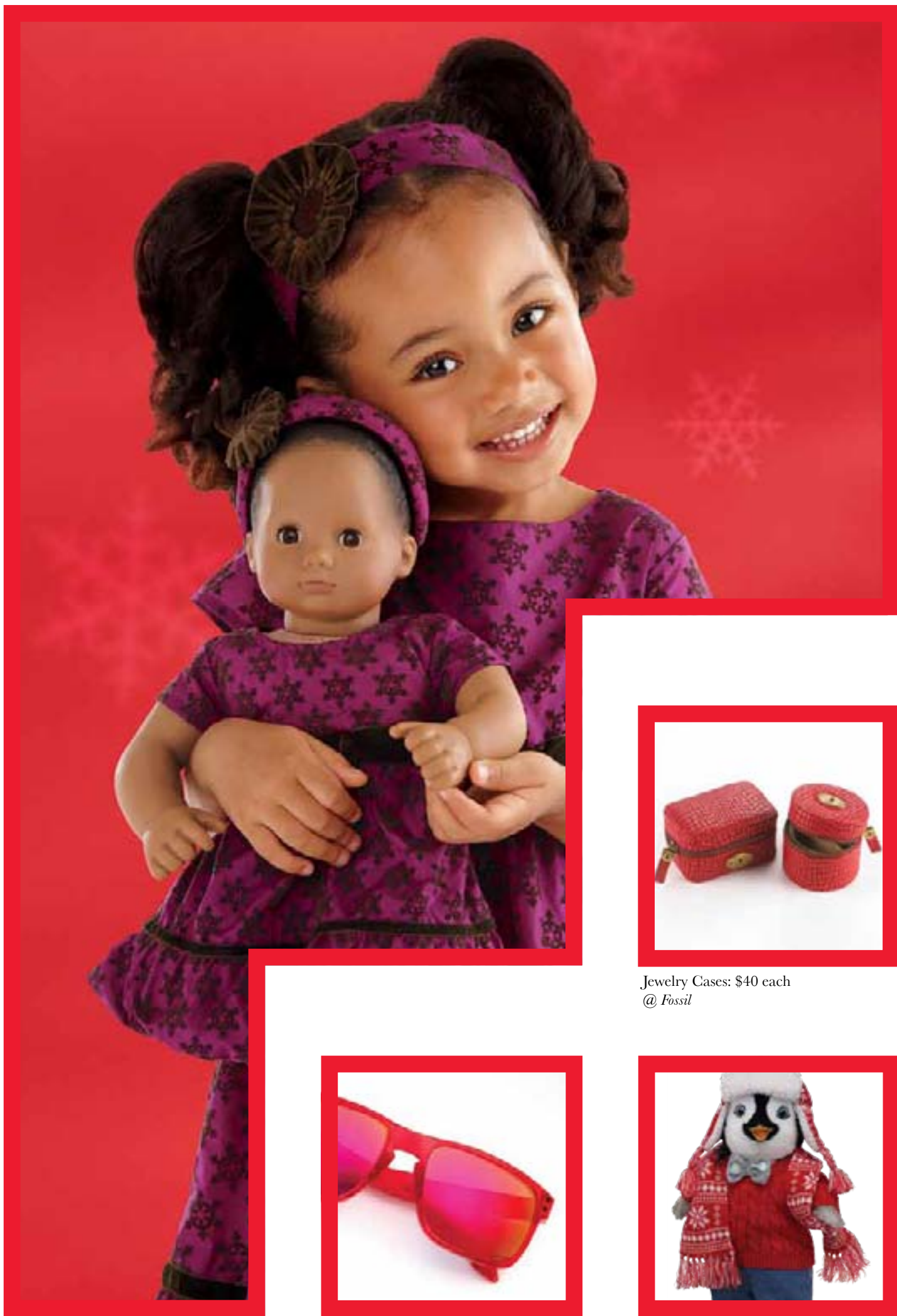
Sweet Snowflake Dress and matching Bitty Baby® Dress: $54 & $26 @ American Girl Coordinating headband sold separately.