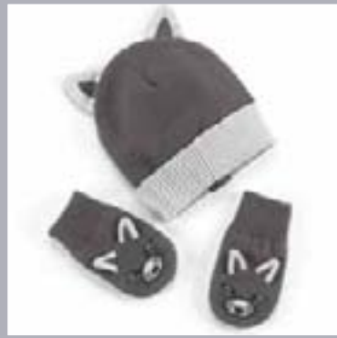
Snow Fox Set: $30 @ Columbia Sportswear