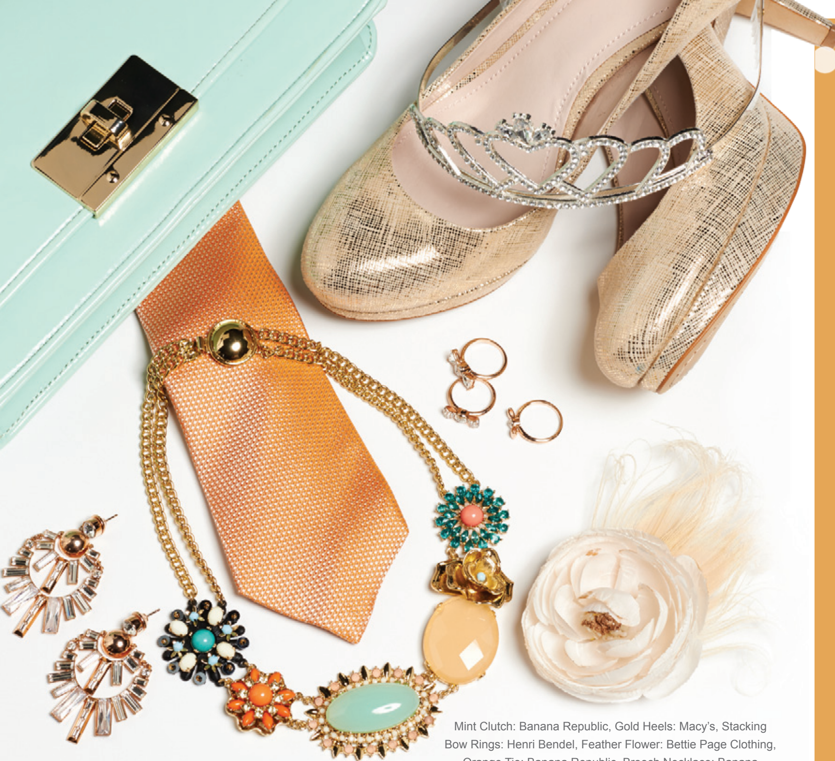
Mint Clutch: Banana Republic, Gold Heels: Macy's, Stacking Bow Rings: Henri Bendel, Feather Flower: Bettie Page Clothing, Orange Tie: Banana Republic, Brooch Necklace: Banana Republic, Art Deco Earrings: Henri Bendel