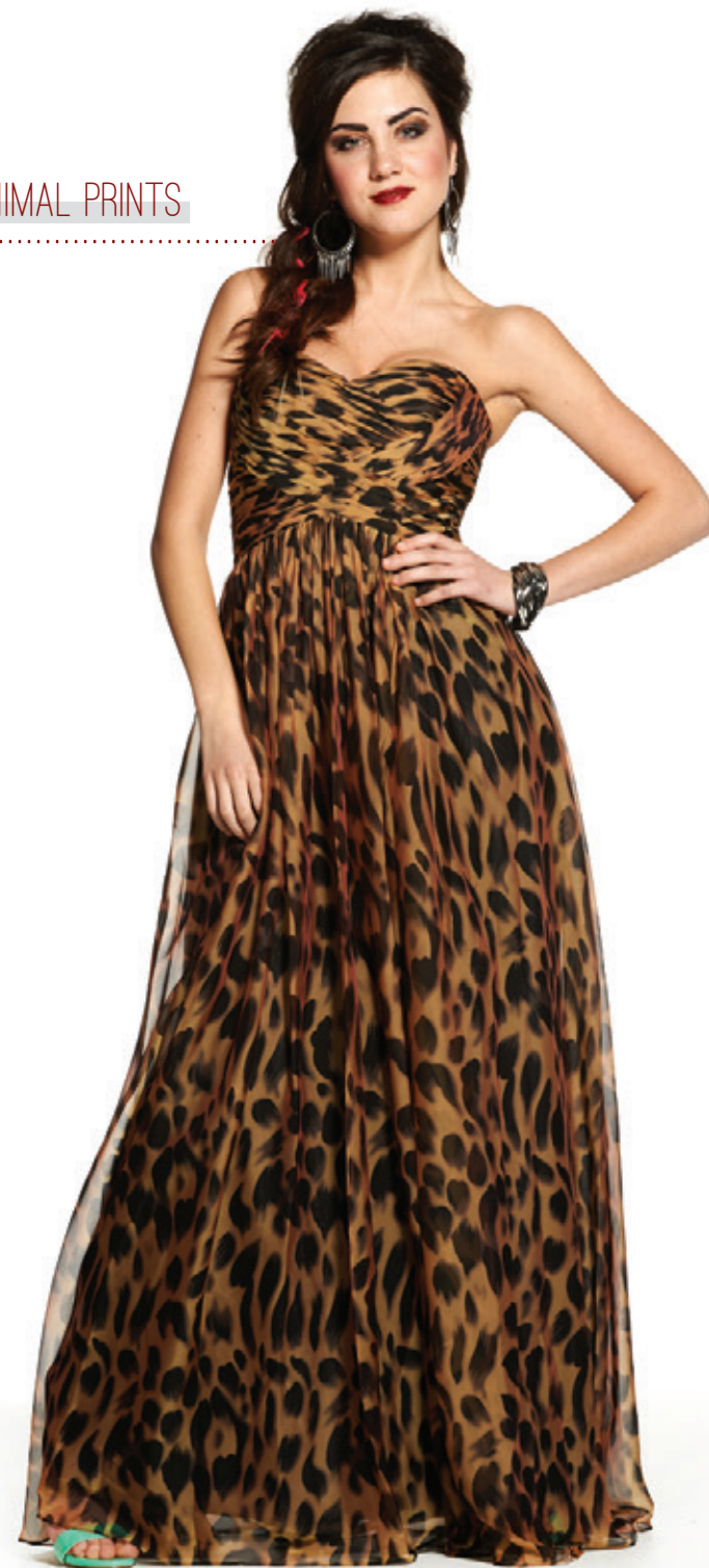
FLASHY ANIMAL PRINTS