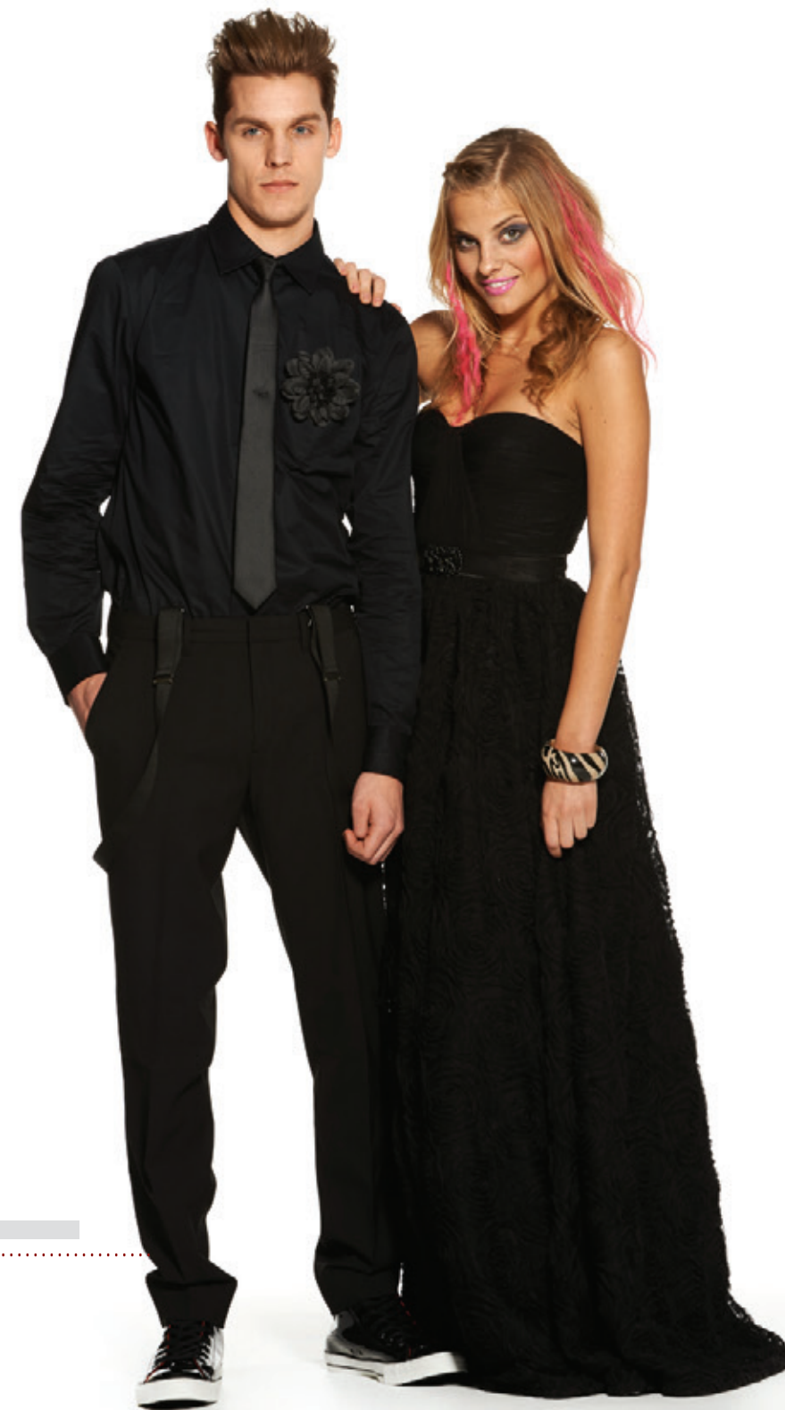
PATENT LEATHER HIGH-TOPS

Black Embellished Dress + Bangles: Macy's Black Studded Boots: Steve Madden Leopard Dress: Nordstrom Silver Bracelet: A|X Armani Exchange Patent Mint Pumps: Steve Madden Men's Black Tie, Shirt + Pants: A|X Armani Exchange Men's Patent Converse: Men's Wearhouse Black Strapless Gown: Caché